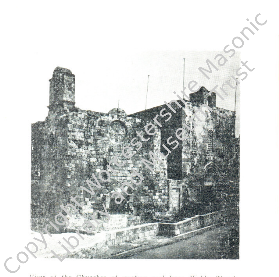
View of the Churches at western end from Kishla Street.