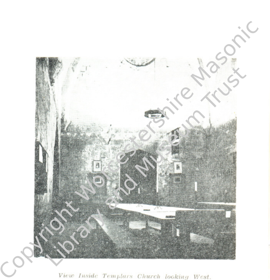
View Inside Templars Church looking West.